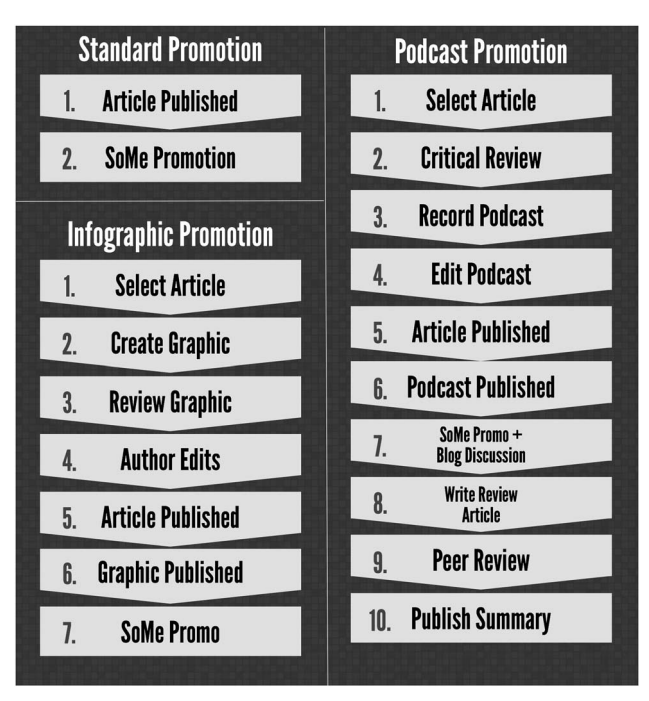
Figure 1. Graphical representation of the social media promotion process for control, infographic, and podcast groups.

All articles included in the study received standard SoMe promotion. This included a tweet from the journal's Twitter account (@CJEMonline) and a post on the CJEM Facebook page containing a link to the article and a brief (1- to 2-sentence) summary of its